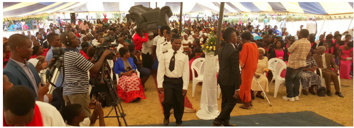
Bringing forward gifts for the new Bishop