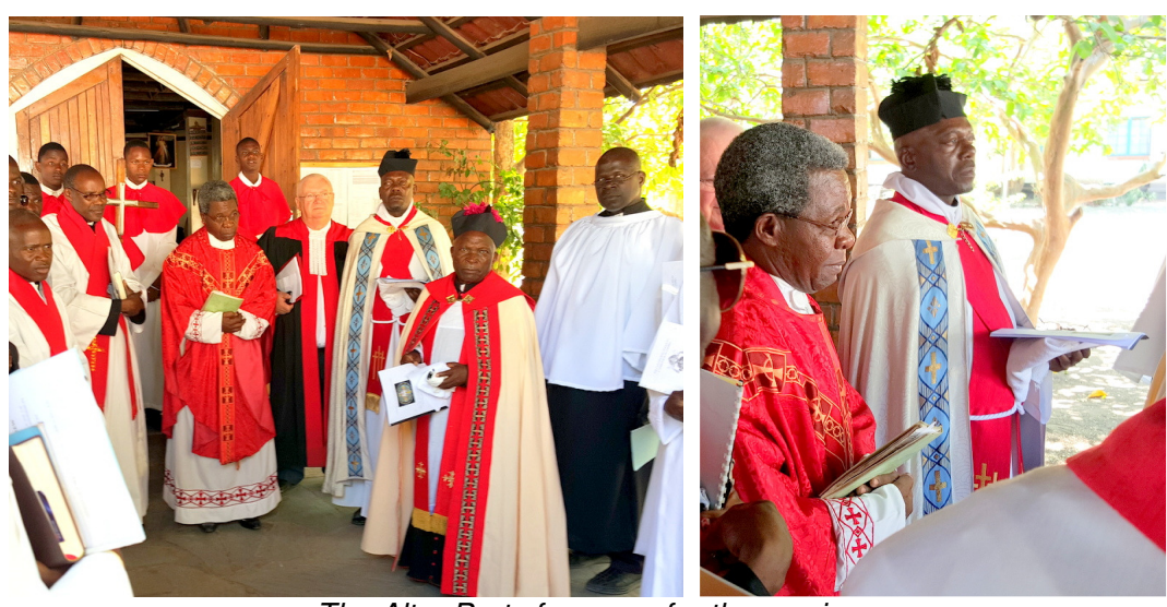
The Altar Party forms up for the service