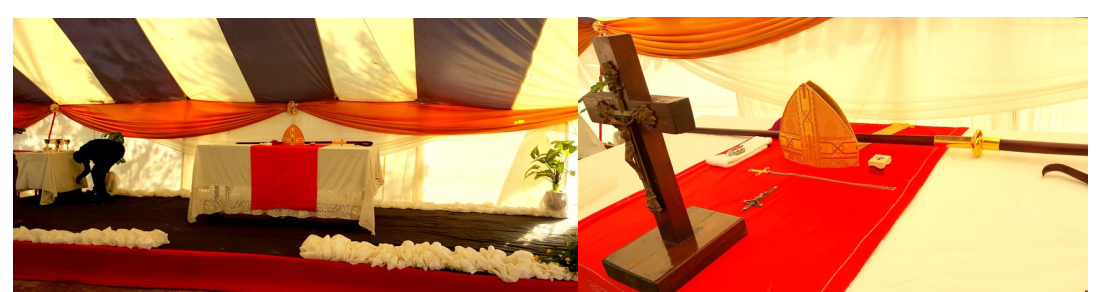
The Altar is set up for the Consecration.