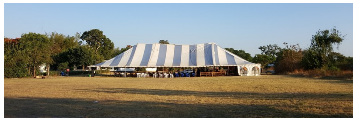
Preparing for the big day