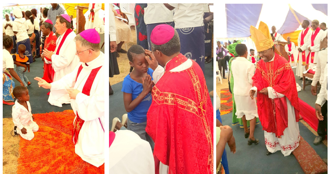
Blessing the children