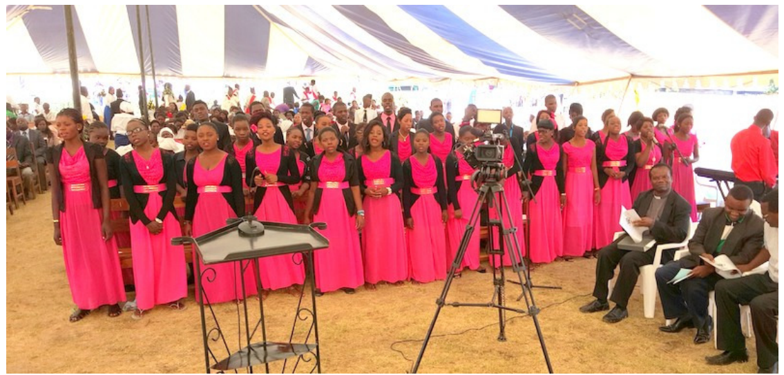
Inside the tent, the choir was leading the worship. Their music was excellent.